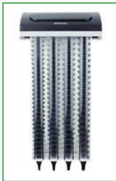
Keeler Disposable Speculum Pk of 500

Code JMU/22002 2mm Code JMU/22003 3mm Code JMU/22004 4mm Code JMU/22005 5mm Code JMU/22009 9mm Code JMU/22100 Set of 5